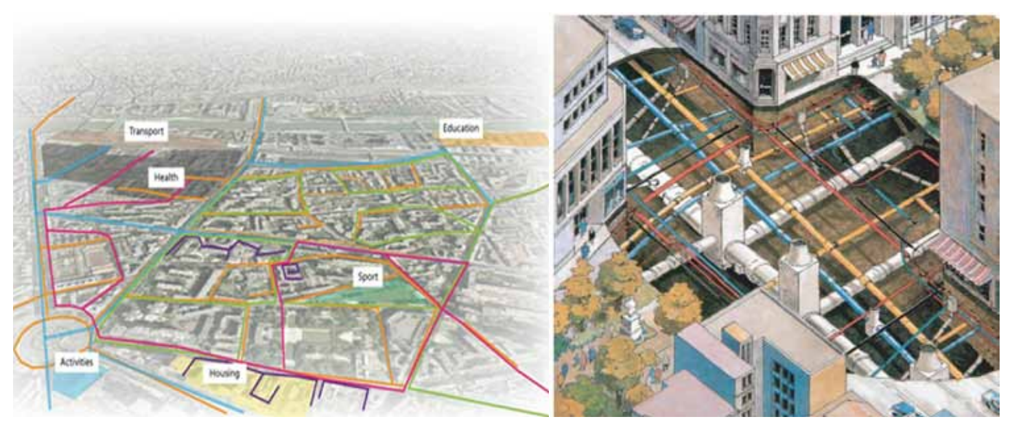
Figure 1. Critical infrastrucutre network as a support of urban life