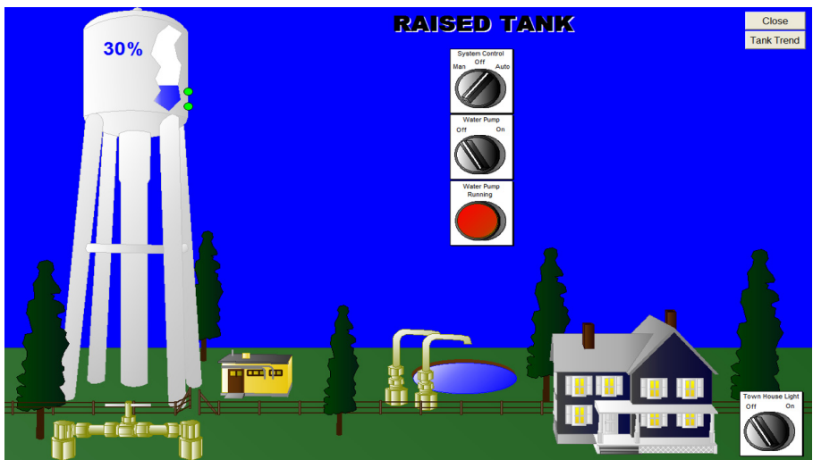
Figure 1. Screenshot from HMI system in the MSU CIPC SCADA Lab

integrated development environment used by engineers to create the interfaces and scripts that make up the HMI. Software-enabled security features are also provided that allow for varying levels of access for different users. For example, an operator’s account can be denied access to modify the interface, exit the full-screen interface, or shut down the system. 4 A number of vulnerabilities in this product have been found that serve as useful examples of how design decisions and legacy code can affect the security of a modern control system. The vulnerabilities discovered are