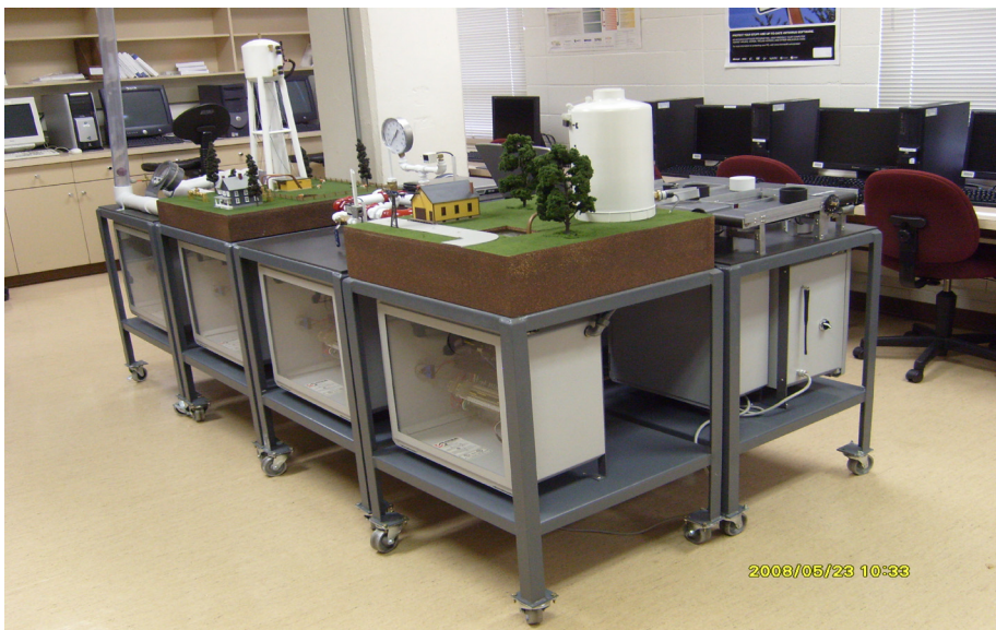
Figure 2. Critical Infrastructure Protection Center SCADA Lab

managed or maintained by IT staff in industrial settings. Such systems are pervasive in what is today referred to as our national critical infrastructure as defined by the U.S. government under Homeland Security Presidential Directive-7 8 . While much of this software is