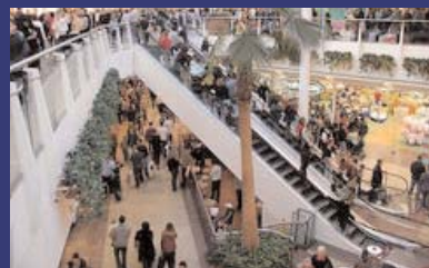
Sports venues, amusement parks, and shopping malls are among the industries that comprise the Commercial Facilities Sector.