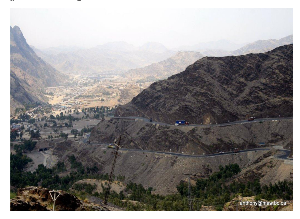
Figure 1: The Khyber Pass, located along the Pakistan/Afghanistan border.