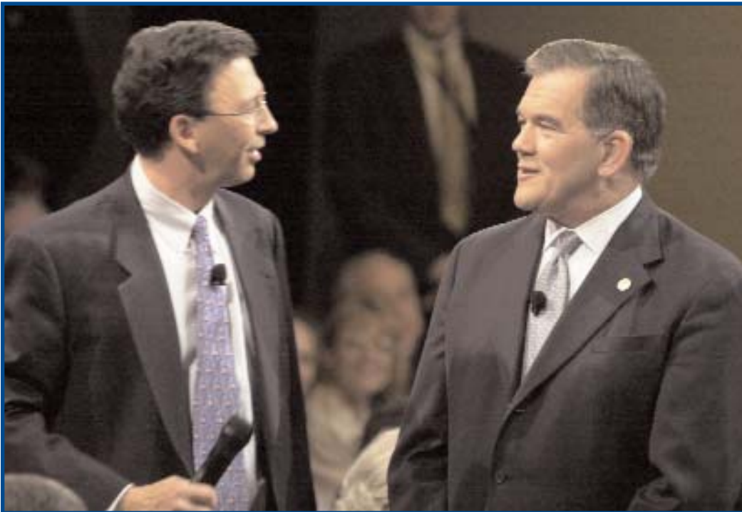
Secretary Ridge, speaking with Frank Sesno at "Target Washington", a town hall meeting aired on public television, co-produced by George Mason University and WETA-TV.

Discussion (Cont. from Page 4) communities in which they work and their employees. So far we've seen tremendous initiative across the economy where we have the opportunity to sit down with corporate leaders and convince them of the prudence and appropriateness of investments. Again, regarding the chemical companies, we haven't asked them to do anything yet beyond the development of the vulnerability assessment tools that shows them a way they can secure some of these facilities. This may cost about three-quarters of a billion dollars and is still not done. You can make a good business case for the supply-chain, to manage it and protect it.