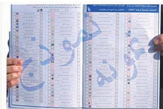
A ballot used in the January 30, 2005 elections.

The constitution implemented several significant changes to the Iraqi legal system. However, before the constitution was adopted, the Iraqi people took several steps to improve the legal system and as a result, several critical steps to remedy the legal system were accomplished. (Continued on Page 9)