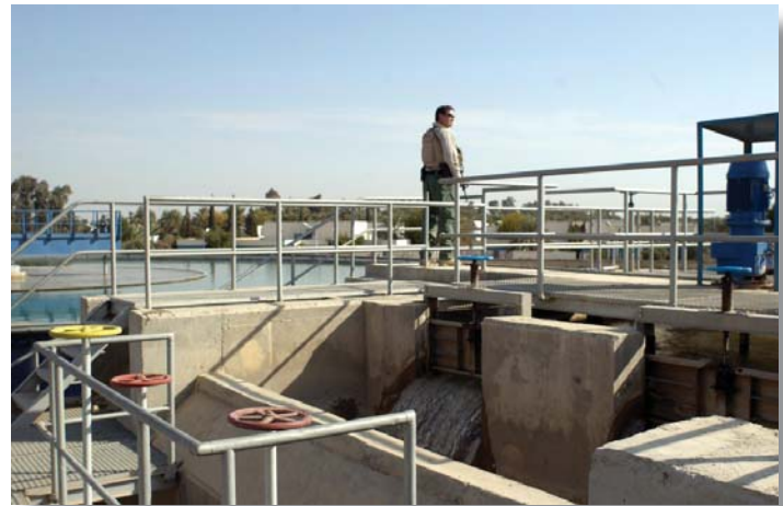
Sharq Diyla Water Treatment Plant

Reconstruction in Iraq is often conducted in perilous conditions and installations such as oil pipelines or power transmission lines unfortunately are exposed to attacks. Iraq's dependence on oil revenues for its development illustrates the importance of protecting critical infrastructure installations. Over 75% of Iraq's national budget in 2007 is projected to derive from oil revenue. Protecting Iraq's linear energy infrastructure and critical nodes to include generation units, transmis-