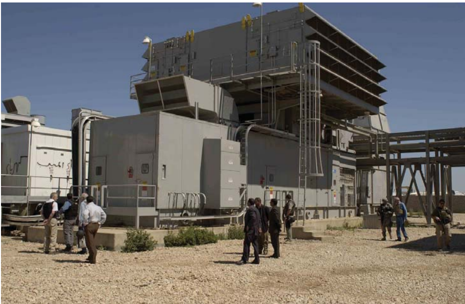
Mussayib Electricity Plant